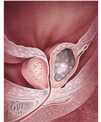
Prostate tumor confined to prostate gland.

I was coming to the conclusion that the average physician might be unduly fearful of the risk of prostate cancer with testosterone therapy. From my lectures to physicians around the country, it became clear to me that many physicians withheld testosterone therapy from their patients because they feared stimulating a sleeping cancer. I thought it might be time to write a review article that put the risks of testosterone in perspective, particularly the risk of prostate cancer. Fortunately for me, the New England Journal of Medicine was receptive to my proposal to consider such a publication.