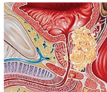
Prostate cancer with infiltration into bladder, lymph nodes, and urethra.

One of the most important and reassuring studies regarding testosterone and prostate cancer was an article published in the Journal of the National Cancer Institute in 2008, in which the authors of eighteen separate studies from around the world pooled their data regarding the likelihood of developing prostate cancer based on concentrations of various hormones, including testosterone. This enormous study included more than 3,000 men with prostate cancer and more than 6,000 men without prostate cancer, who served as controls in the study. No relationship was found between prostate cancer and any of the hormones studied, including total testosterone, free testosterone, or other minor androgens. In an accompanying editorial, Dr. Carpenter and colleagues from the University of North Carolina School of Public Health suggest scientists finally move beyond the long-believed but unsupported view that high testosterone is a risk for prostate cancer.